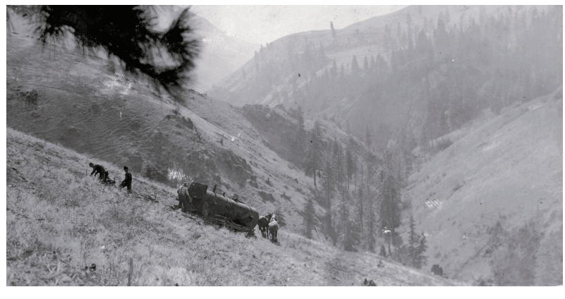
Transporting equipment to the Mill at Deer Creek Mining & Milling Co