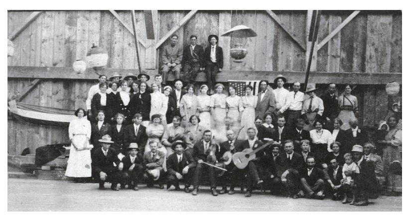
Deer Creek Mine - After The Ball - Mine Grand Opening, July 4-5, 1913