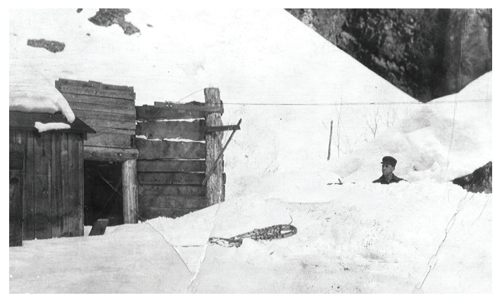
WJ Orr at mine