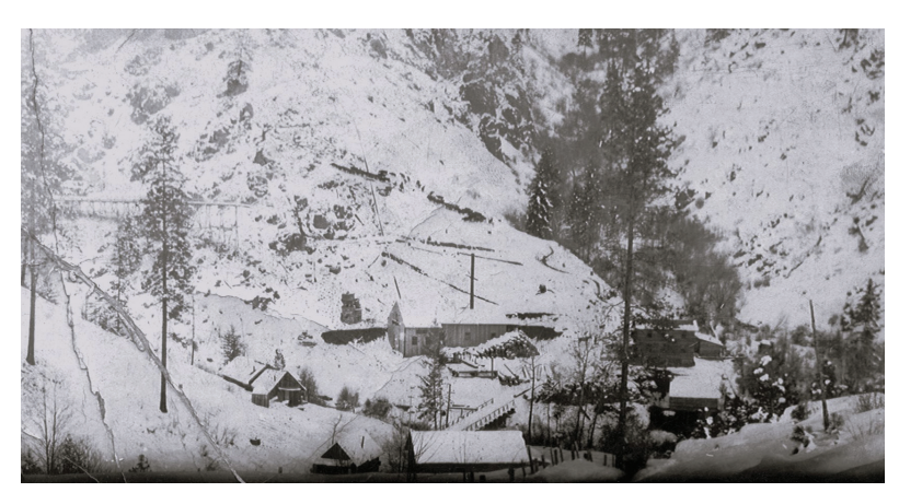
Deer Creek Camp in winter